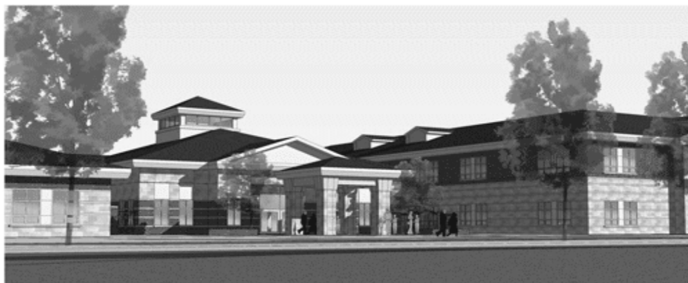
George P. Phenix PreK-8 School